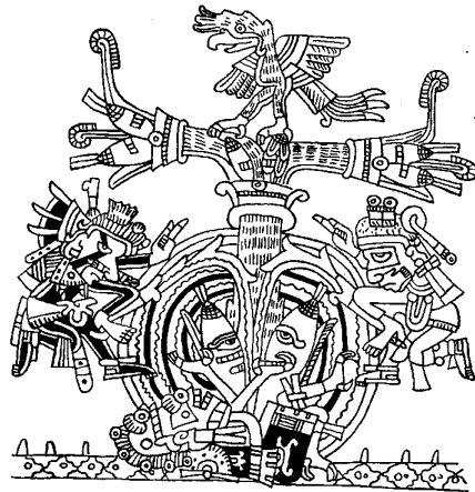
Fig. 36. Tree of Life from the Codex Borgia. Heaven above, Earth below. Quetzalcoatl on the left, Xochipilli on the right, evoke the unifying movement, first of descent and then of ascent.

If we look at an image of the Tree of Life (Fig.3) in the Borgia Codex, we see this same cycle depicted as Quetzalcoatl descends on the left (west) into the Underworld toward a reclining figure whose head is a skull emerging from another skull and whose hands and feet are like the talons of the eagle which appears above. From the center of this figure rise two sacrificial knives, each with a human eye as a symbol of the day world of human consciousness (which alone is capable of the moral self-sacrificial act). Out of them rises the tree of life surmounted by an eagle. So much can be said about this image, but I simply